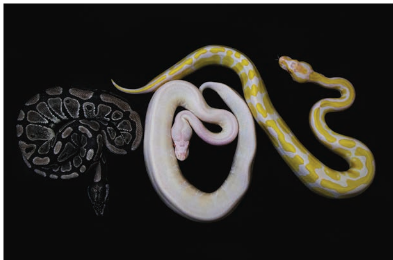
Photo above: Ball python designer morphs on display at a pet expo, Memphis, USA.

A “designer morph” Ball python is the creation of a breeder who has combined two or more “wild morphs” to create something never seen in nature. 91 Some breeders view wild-sourced Ball pythons from Africa as potentially valuable new genetic “stock” that can aid them in their efforts.